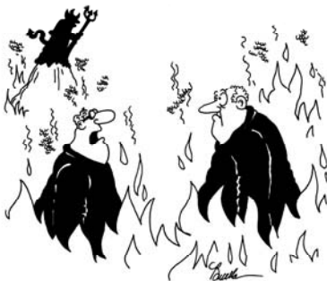
“I wrote assembly instructions for Children’s toys. What did you do?”

Why Your “Not-To-Do” List Is Just As Important As Your “To-Do” List .....Page 4